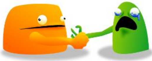
The Bone Crusher