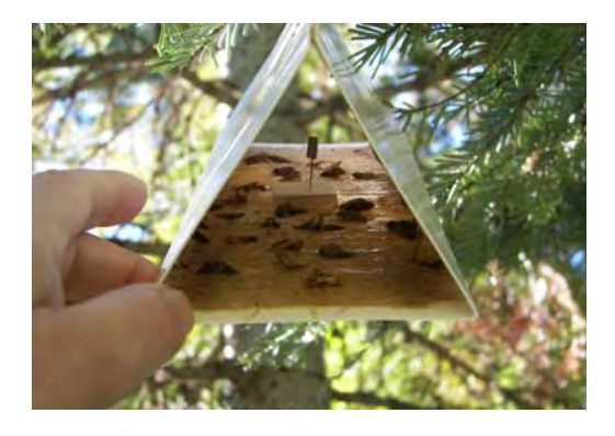
Budworm populations remain high

The greatest returns come from estimates of the value of harvested forest products, reduced fire fighting costs and preventing standing timber from burning assuming that if were not harvested it would have an amenity value at least equal to its stumpage value.