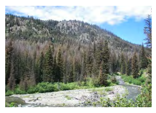
Riparian forests are equally affected