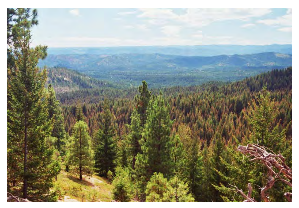
Private timberlands five years into the budworm infestation

The Teanaway watershed is headed for a catastrophic wildfire unless solutions are found for the confounding problems of endangered species restrictions on management, paralysis of federal forest process and loss of forest products markets in the region