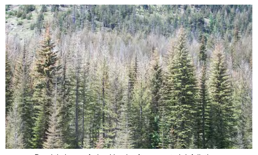
Dead timber on federal lands after repeated defoliation