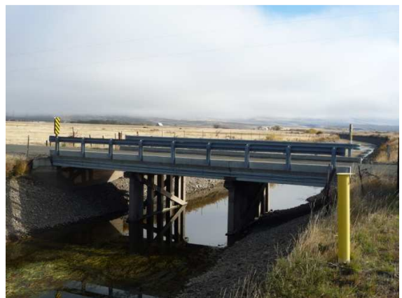
Lower Green Canyon Road Bridge