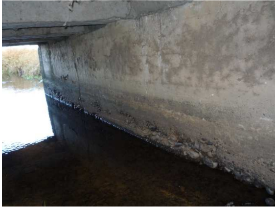
S. Ferguson Road Bridge