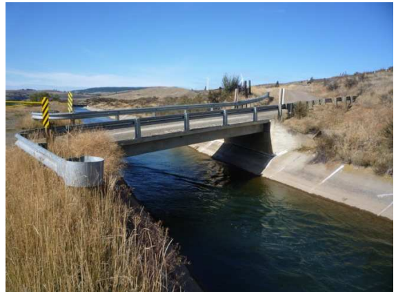
Hayward Road Bridge