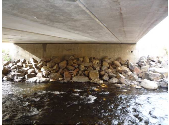
Naneum Road Bridge