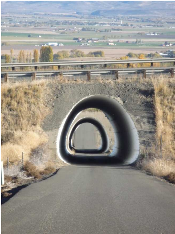
Under I-82 1