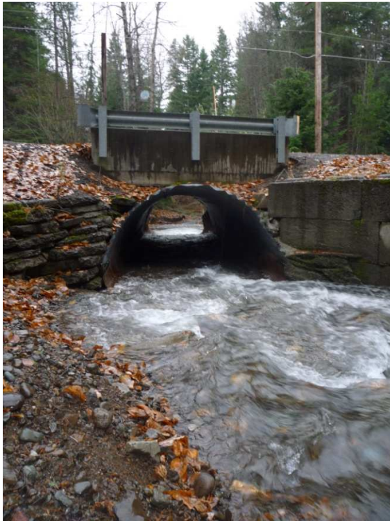
Sparks Road Culvert