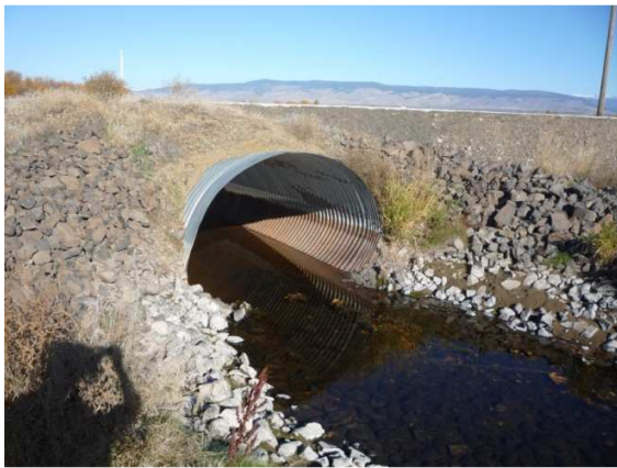
Bridge on Bowers Road