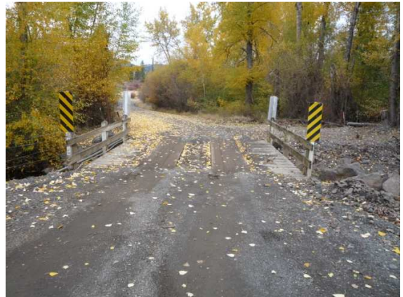
Cooke Canyon Road Bridge