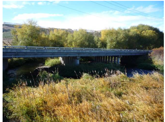
Thrall Road Bridge 2