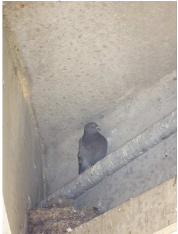
Wildlife Beneath a Bridge