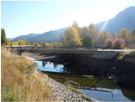
Mohar Road Bridge