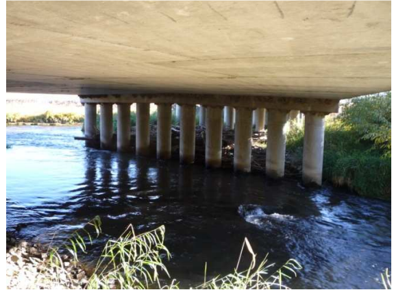
Thrall Road Bridge 1