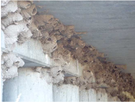
Bird Condos at Thrall Road Bridge