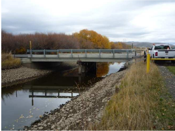
Lester Road Bridge