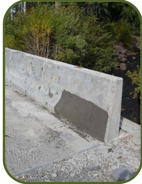
Finish Work for Traffic Barrier