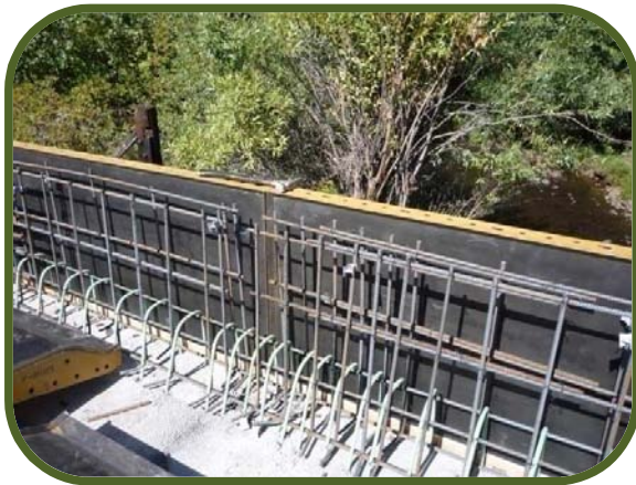
Re-Steel in Place for Traffic Barrier