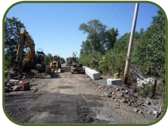
Charlton Road Bridge Construction Site

Progress: The superstructure is complete; approach embankments are constructed and approach asphalt paving is almost complete. MRM will most likely complete the project by the first of November.