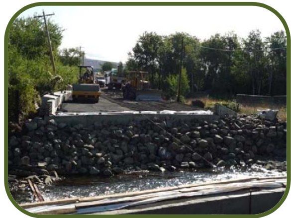
View of West Abutment Wall