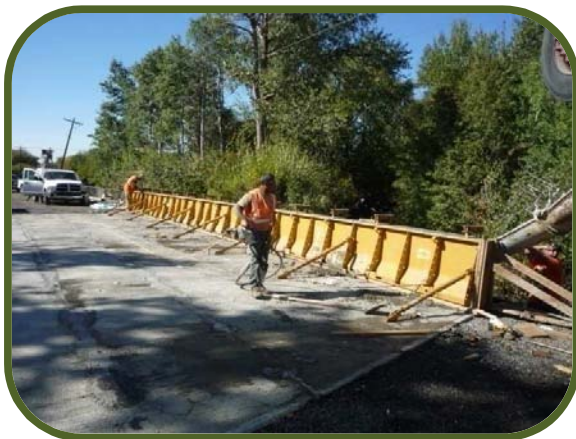
Forms and Bracing for Traffic Barrier