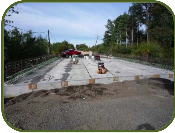
View of Deck Welding and Grouting