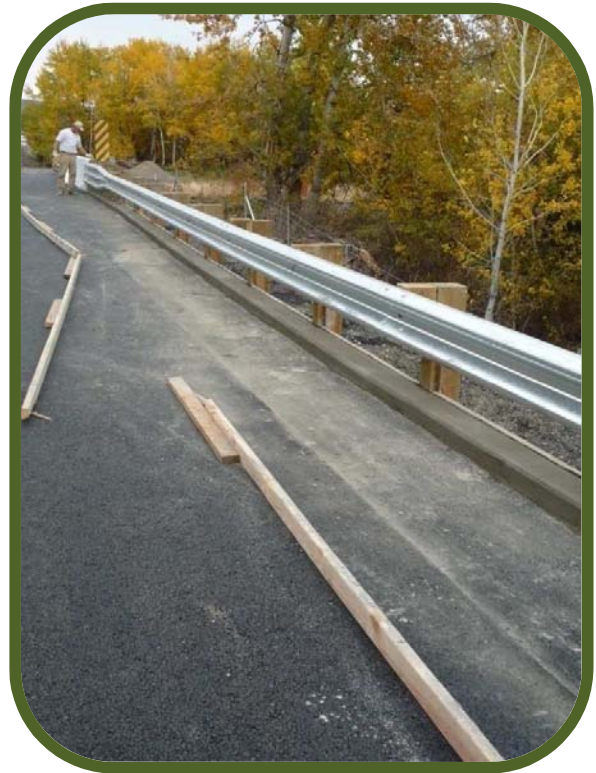
Form Removal for Extruded Curb