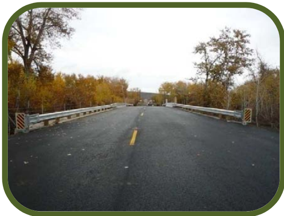
Complete and Open to Traffic !