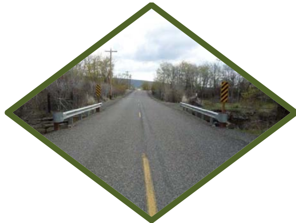
Pre-Construction Charlton Road Bridge