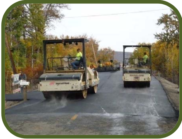
Rolling Approach Asphalt