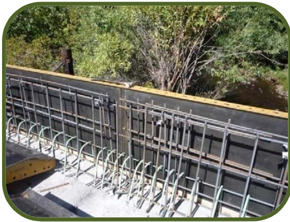
Re-Steel in Place for Traffic Barrier