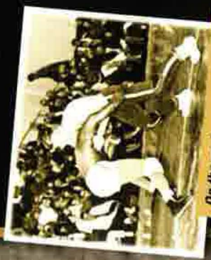
On the mat as a CWU Wildcat

According to the Department of Defense, San is the only Vietnam veteran from Kittitas County yet to be returned home.