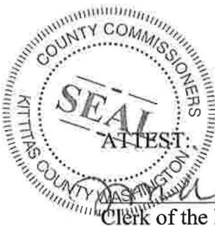
Clerk of the Board