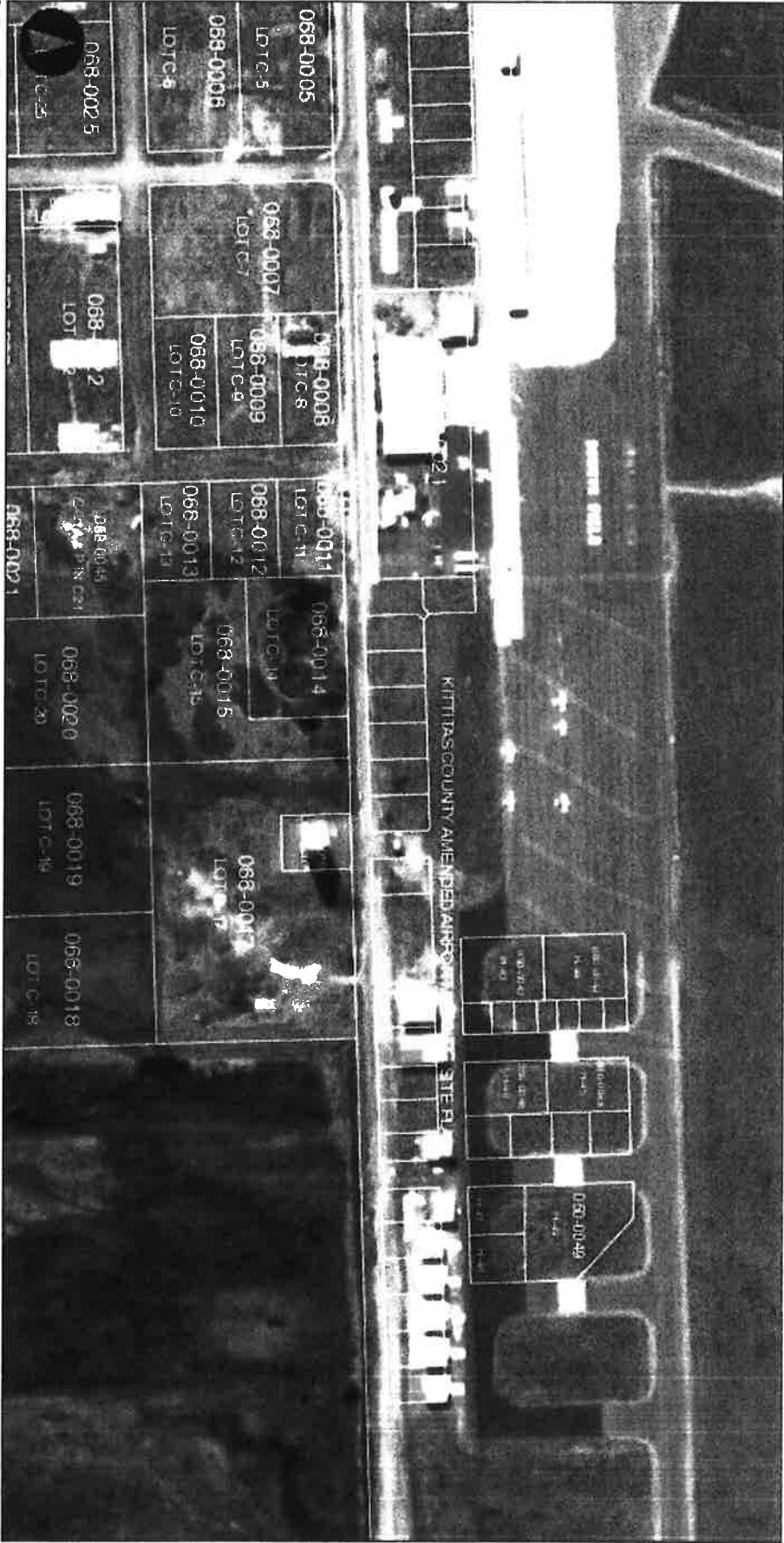
Map Center: Township:18 Range:18 Section:24

Kittitas County makes every effort to produce and publish the most current and accurate information possible. No warranties, expressed or implied, are provided for the data, its use, or its interpretation. Kittitas County does not guarantee the accuracy of the material contained herein and is not responsible for any use, misuse or representations by others regarding this information or its derivatives.